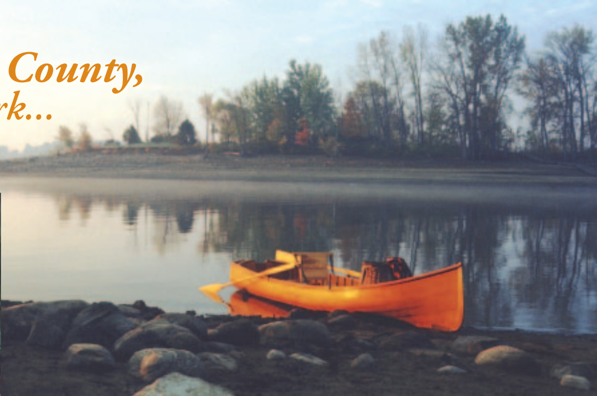
Great Sacandaga Lake at Sunrise